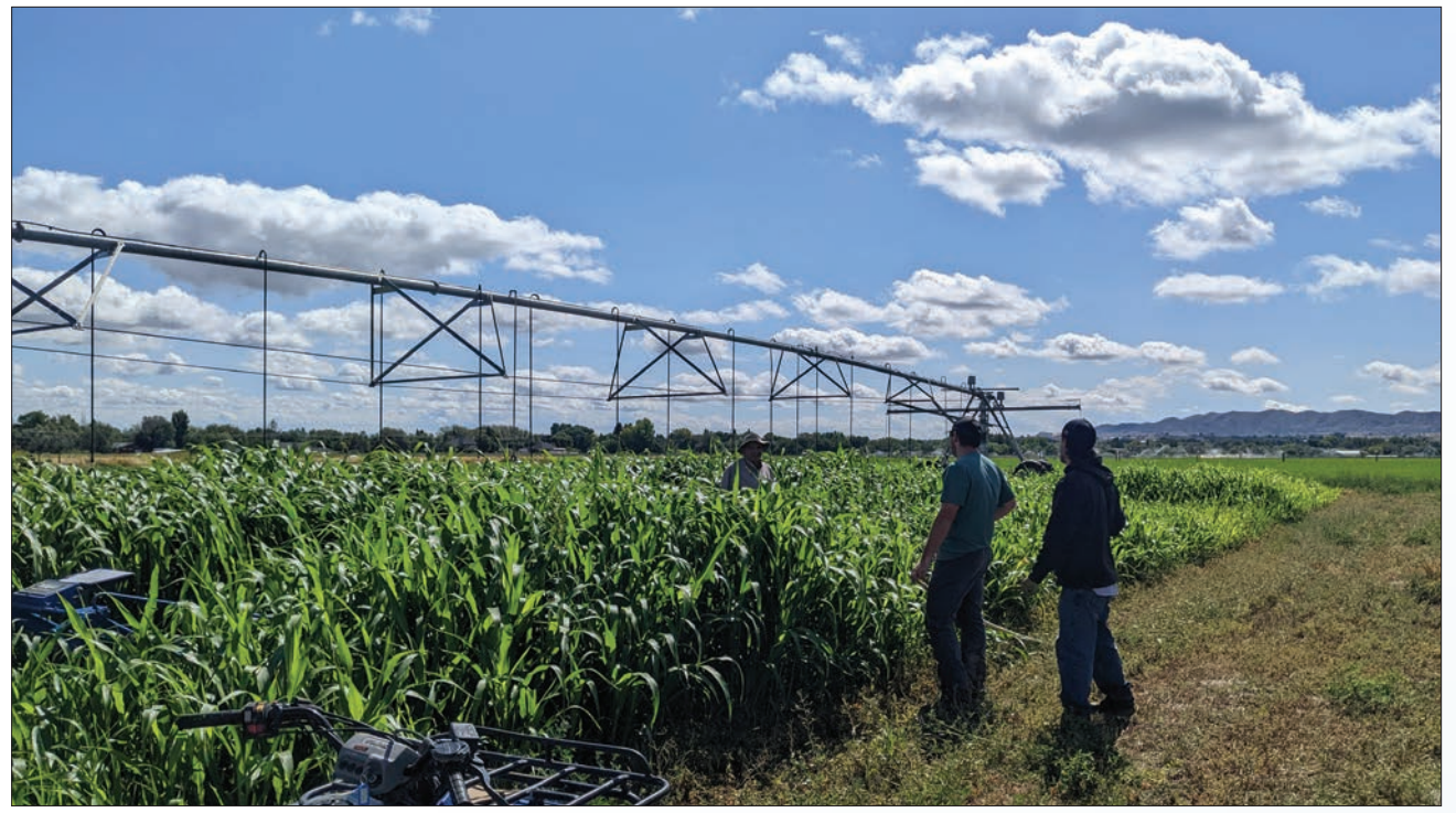
Combinations of conservation practices could provide long-term irrigation savings.