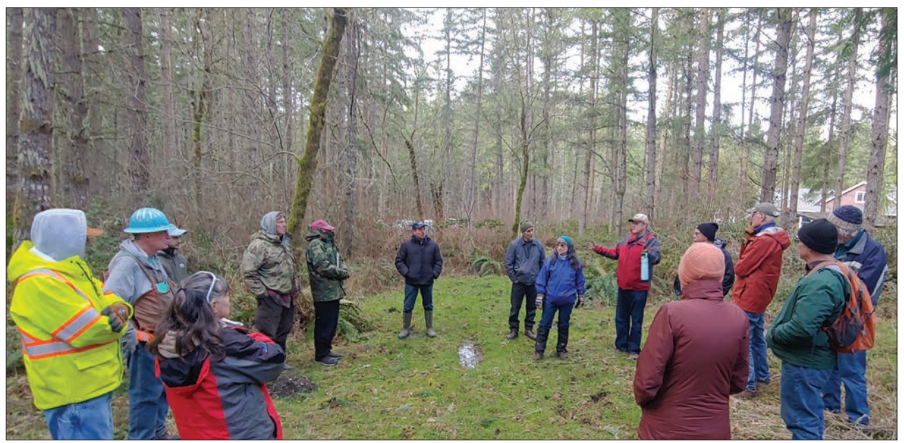
The Northwest Natural Resources Group hosts a forestry tour for small woodland owners.

ment practices to better protect their resources for both economic production and conservation.