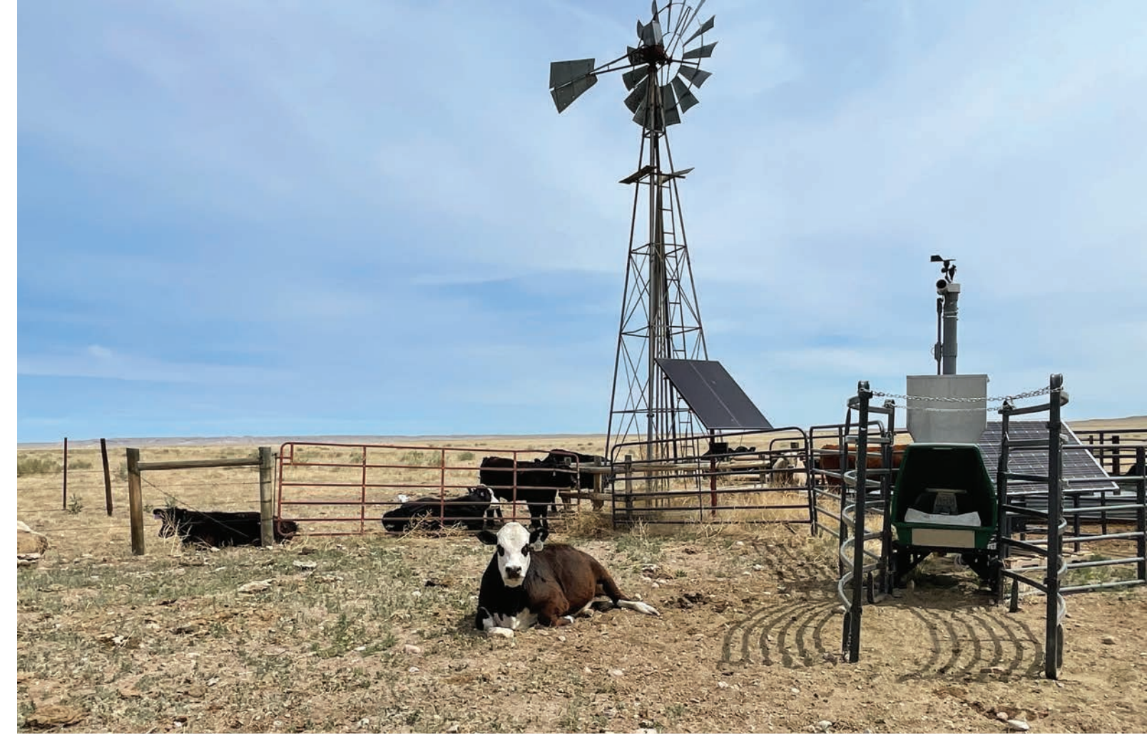
Research steers in the shortgrass steppe pasture at Colorado's Central Plains Experiment Range. Steers from the region had lower methane emissions intensity than those imported from a tall grass prairie ecosystem in Nebraska.