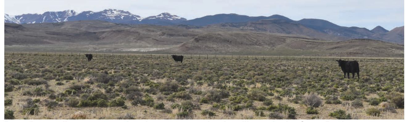
Post-fire seeding efforts seek to improve rangeland resilience in the Great Basin.

Massive wildfires are on the rise throughout the West, reshaping plant communities and endangering native grasses that are a key source of forage for livestock. Reseeding with locally sourced seed is a common rangeland restoration strategy, but climate change raises an interesting question: What's the best way to heal the land when its future environment might not look like its past?