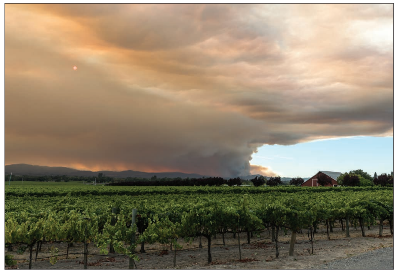
Smoke from a wildfire darkens the skies over Sonoma, California.