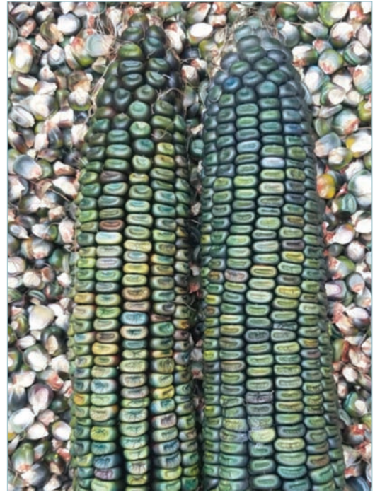
Dry-farmed Oxacan green corn is being used commercially to make green masa and tortillas.

Nebert also received a Western SARE Research to Grass Roots grant for a dry farming acceleration project, helping growers try dry farming for the first time.