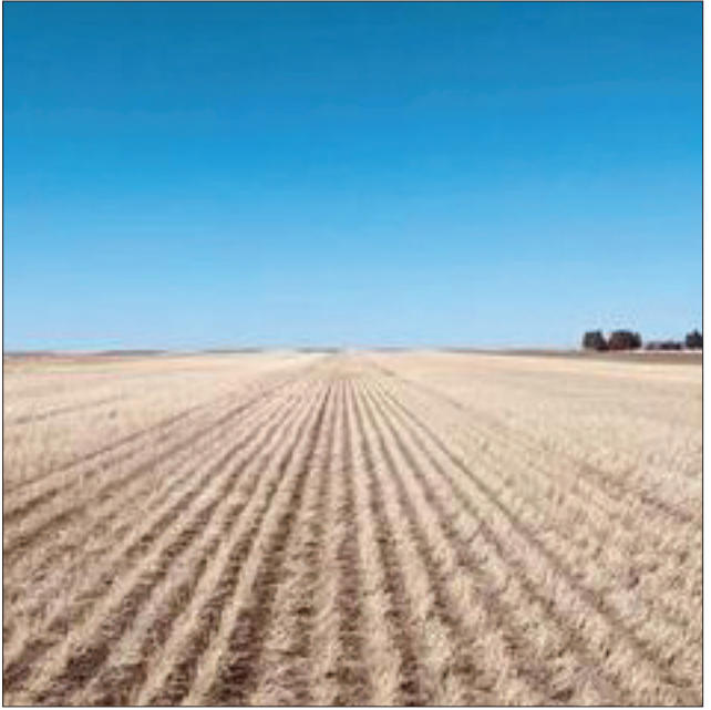
In eastern Wyoming, Kernza is being studied as an alternative to wheat-fallow and other land uses in the dry environment.

"In general, planting anything to perennials instead of annuals will have major benefits in